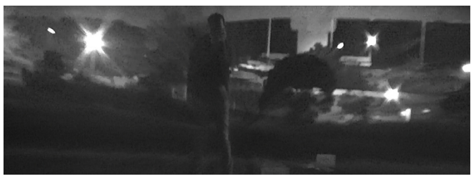
Without Smart IR II